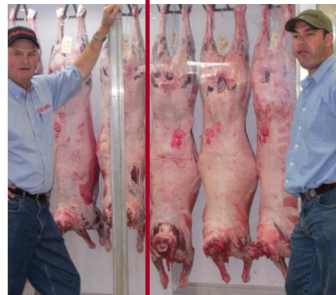
Other Competitors 3 rd place: 20% lighter